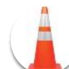
Streets & Drainage